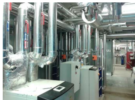
Heat extracted from Venetian Lagoon water is used to heat and cool buildings in the Venice Arsenal.