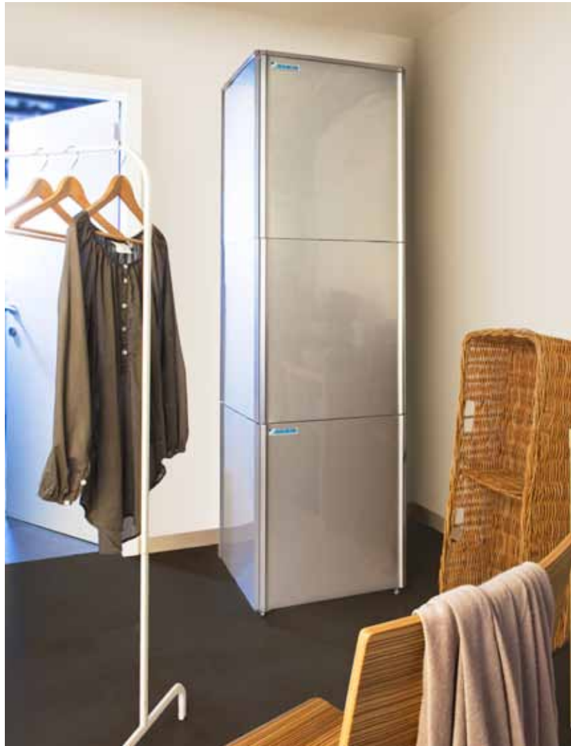
Indoor unit and domestic hot water tank can be stacked

* COP (Coefficient of Performance) of up to 3.08 EW: 55°C; LW 65°C, Dt 10°C; 7°CDB/6°CWB